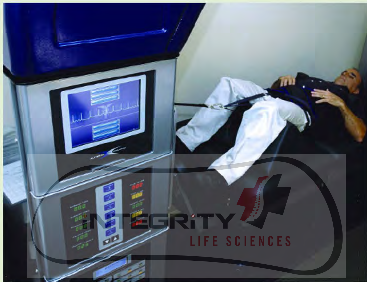
Figure 1. A volunteer illustrates how the spinal decompression harness is attached for a treatment session.

ed to final levels of 4.54 kg–9.07 kg more than half their body weight.